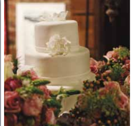
Far left, Bride and Groom: Photo courtesy of sugarsnapin.com; Large exterior of Anderson Arts Center: Photo courtesy of roycroftart.com; Right, thumbnails and front cover: Photos courtesy of sugarsnapin.com.

110 Federal Street | Anderson SC 29625 864.222.2787 | www.andersonarts.org